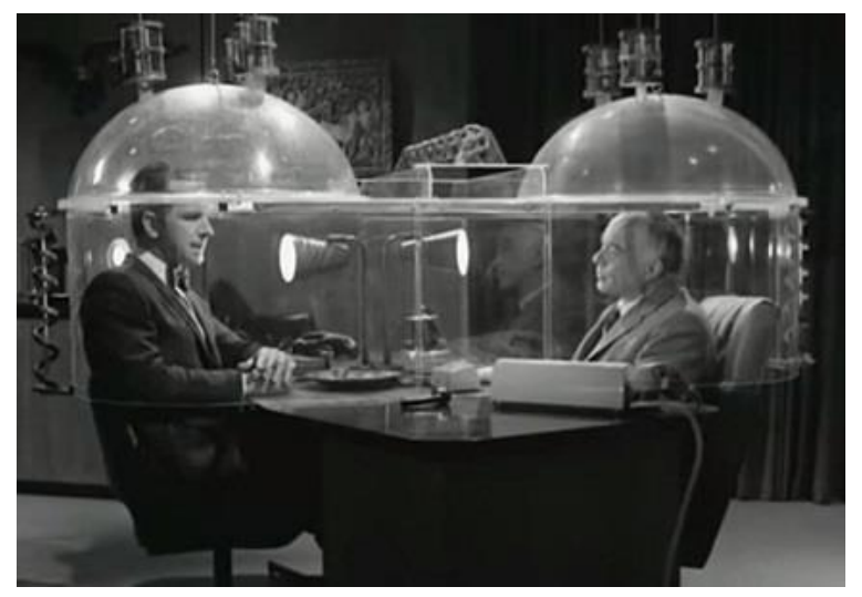
The "Cone of silence" from Get Smart

"This is 'cone of silence' time. This is protected time. We have to trust this group so we can express our points of view openly and honestly. [...] we need that open dialogue to get to the heart of some of the complex issues that we have to face." – SW5 Core Leader