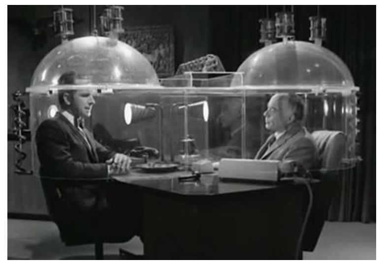
The "Cone of silence" from Get Smart